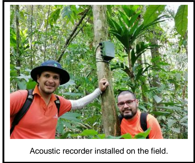
Acoustic recorder installed on the field.

In this first step, we seek to generate information, processing and analyzing the recordings. In this way, Fonafifo signed a cooperation agreement with the International Institute for Conservation and Wildlife Management (ICOMVIS) of the National University of Costa Rica.