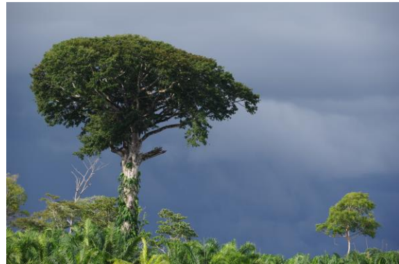
Ceiba tree ( Ceiba pentandra )

2. The donation can be presented as an Environmental Contribution in contracting processes carried out by the public sector, or in compliance with some requirements of the ICT Tourism Sustainability Certificate.